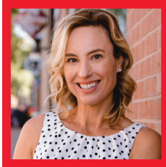
Ruth Ganey Photography